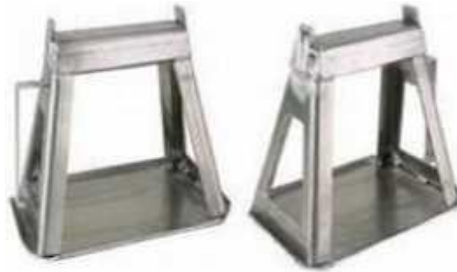
Exhibit 2: Transponder Mounting Location